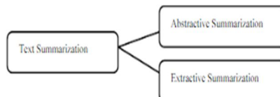
Fig. 1. Types of Summarizations

As we embark on this exploration, the project seeks not only to address immediate challenges but to contribute to the broader narrative surrounding the interaction between artificial intelligence and human cognition. The ensuing sections delve into the intricacies of our methodologies, the myriad applications envisioned across sectors, and the profound implications for the evolving landscape of information consumption. Through this project, we aspire to usher in a new era where technology becomes an enabler, enhancing our ability to navigate and comprehend the ever-expanding realm of digital knowledge.