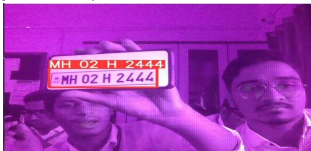
Fig 3: LPR to get access

In addition, the ability to monitor activities in real time added additional value by revealing usage patterns and controls off bottom line compliance thus facilitating timely intervention and security action. These results clearly highlight the role of TechGuard in improvement of security, space optimization and enhancement of the overall experience of users. There is, however, enough space for further research in trying to identify possible improvements in the management and integration of such systems so as to minimize challenges witnessed during the use of the systems.