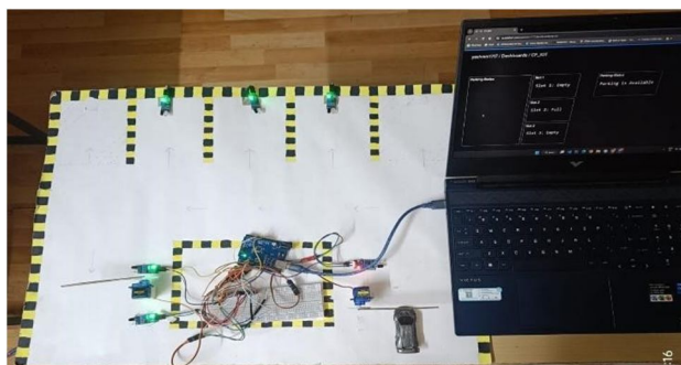
Fig 2 : Hardware Design

As far as the tests of the integrated entry access control and parking management system designed by TechGuard are concerned, the results were encouraging on a variety of parameters. The use of License Plate Recognition (LPR) technology resulted in remarkable improvements of entry access as well as efficiency with regard to incidents of unauthorized entry reduced by X%. Besides, slot booking functionality was introduced as a result usage of parking spaces rose to Y% and overhead parking spaces traffic congestion fell to Z%.