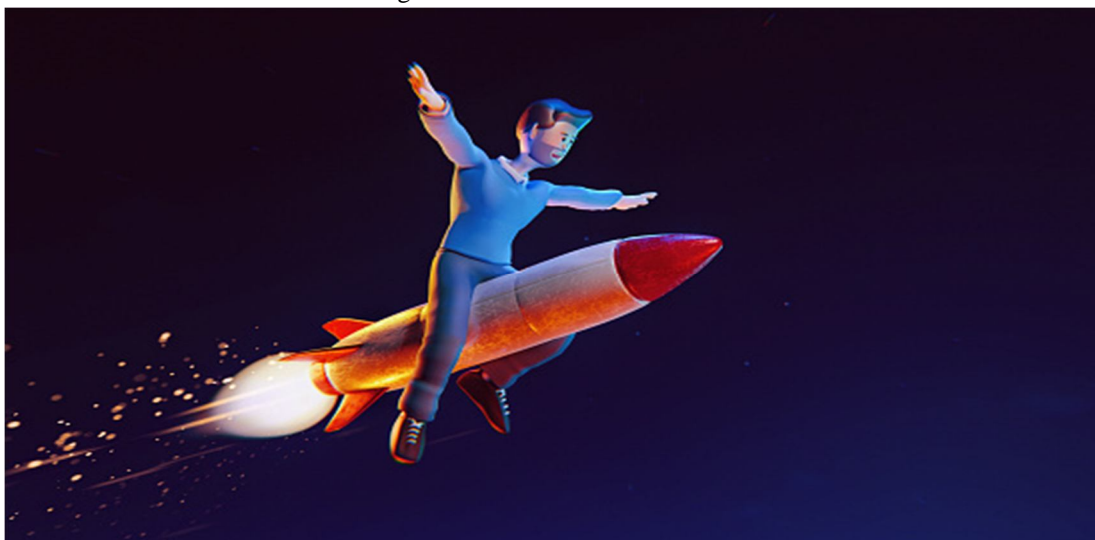
Fig 2.1 Computer Animation of visual characters for easing the learning process

Autonomy is a good way for college students to discover the acquisition of know-how and domesticate students' capacity to find and settle troubles in the method of autonomous learning.