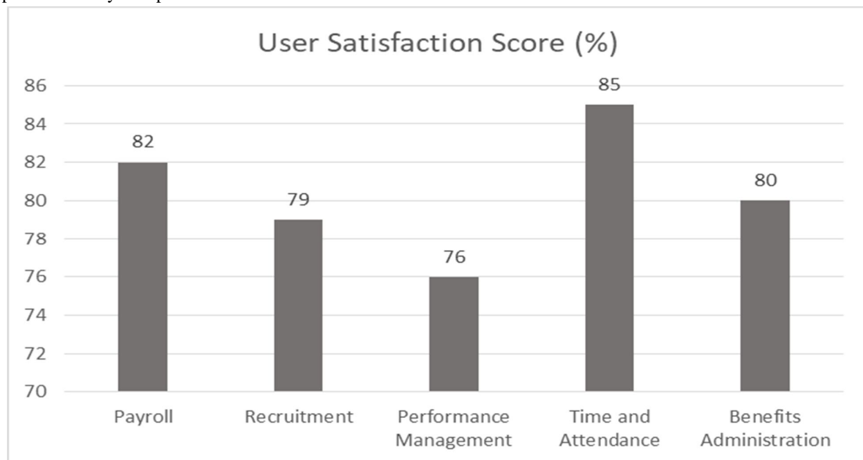
Fig. 1: User Satisfaction Scores by HCM System Module [6]

User satisfaction was assessed through a comprehensive survey distributed to 500 end-users of HCM systems. The survey, based on the SERVQUAL model adapted for IT services, measured various dimensions of BA support quality. Results indicated an overall satisfaction rate of 78%, with BAs receiving particularly high scores in the areas of communication clarity (85%) and technical knowledge (82%). System performance metrics, including system uptime and transaction processing times, showed a strong positive correlation ( r = 0.72, p < 0.001 ) with user satisfaction scores, suggesting that effective BA support contributes significantly to both user experience and system performance.