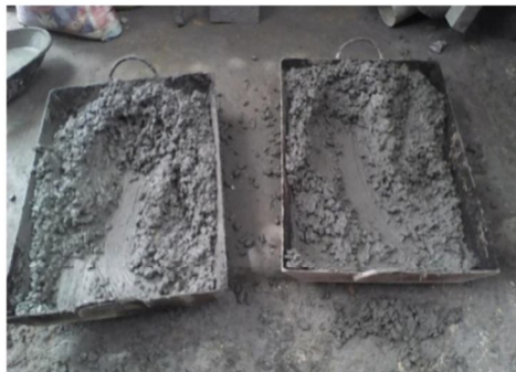
Figure 2: Concrete Mix Sample