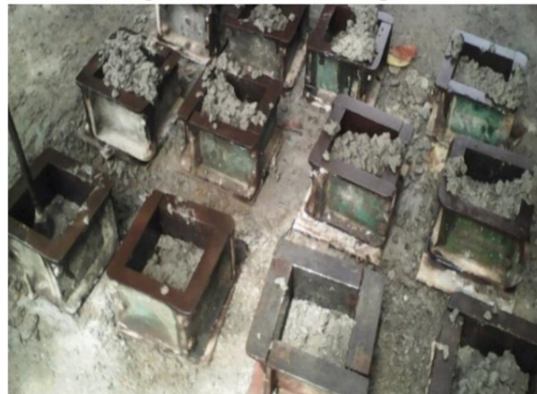
Figure 3: Concrete Placing in Cube Moulds