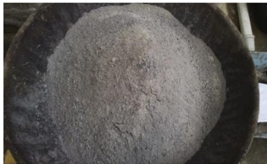
Figure 1: Grit sample

The concrete cubes were made in standard moulds at a mix design ratio of 1:2:4 and w/c of 0.35, 0.45 and 0.60. The slump of the wet concrete was measured maintaining the specifications of the BS 1881: Part 102 (1983). For each type of fine aggregates 3 cubes (150x150mm) were cast also in accordance to BS 1881: Part 108 (1983). After one day of casting, the concrete cubes were removed from the mould and were transferred to a water tank for curing until the specimens are ready for compression test.