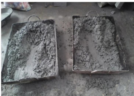
Figure 2: Concrete Mix Sample