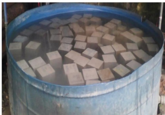
Figure 4: Cubes in Curing Tank