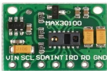
Fig 3.3 MAX30100 integrated pulse oximetry and a heart-rate sensor.

The pulse oximetry and heart-rate sensor were included in the MAX30100. Using two LEDs—a red and an infrared one to emit two different light wavelengths, this optical sensor measures the absorbance of pulsating blood using a photodetector. It is ideal to read the data with the tip of your finger when using this specific LED color combination. The target MCU receives the signal through the micro-BUS I2C interface after being processed by a low-noise analog signal processing unit. Additionally, excessive pressure may narrow capillary blood flow, which would reduce the data's dependability. It is also possible to program an INT pin.