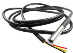
Fig 3.2 DS18B20 Temperature Sensor

Although temperature itself is not a direct measure of cardiac function, changes in temperature can serve as valuable indicators of various physiological processes and health conditions. In a comprehensive health assessment, monitoring multiple vital signs, including temperature, provides a more holistic view of an individual's well-being and helps healthcare professionals identify and address potential issues early. Fig represents DS18B20 Water Proof Temperature Probe – Black (1m) Original Chip.