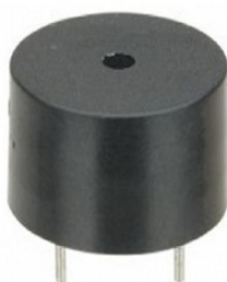
Fig 5. Buzzer

An Arduino buzzer, also known as a piezo buzzer, is a small speaker that can be directly connected to a microcontroller like the Arduino Uno. When sensors (ultrasonic sensor, water sensor, and heat flame sensor) detect any obstacles in front of a blind user, the buzzer works as an alarm unit, alerting the user through its sound. By sounding an alarm, the user can be aware of potential hazards ahead and take the necessary steps to avoid them. The buzzer can be programmed to produce sound at a frequency that is set by the user. It operates based on the reverse of the piezoelectric effect, where the piezoelectric crystal vibrates and produces sound waves. This vibration generates sound waves that travel through the air and can be heard by the user. The Arduino buzzer is an important component in the smart stick system for assisting blind people. It serves as an effective alert system and enhances the safety and mobility of visually impaired individuals.