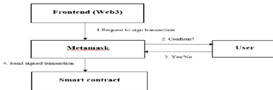
Fig. 3. Working of Smart contract

Decentralized peer-to-peer (P2P) applications have gained significant attention in recent years due to their potential to create a more secure and transparent system for online transactions, without relying on intermediaries. The purpose of this research project is to introduce and analyze the development of a decentralized P2P app, built on Web3 technology, which enables secure and direct communication and exchange of data and assets between users. They provide a more secure and transparent platform for communication and transactions, as every transaction is recorded on a decentralized ledger that is immutable and tamper-proof. This eliminates the need for intermediaries, reducing transaction fees and ensuring greater privacy and security for users. Smart contracts can be programmed to automatically execute transactions once certain conditions are met, such as the receipt of payment.