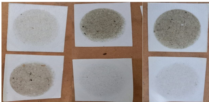
(a) (b) (c)