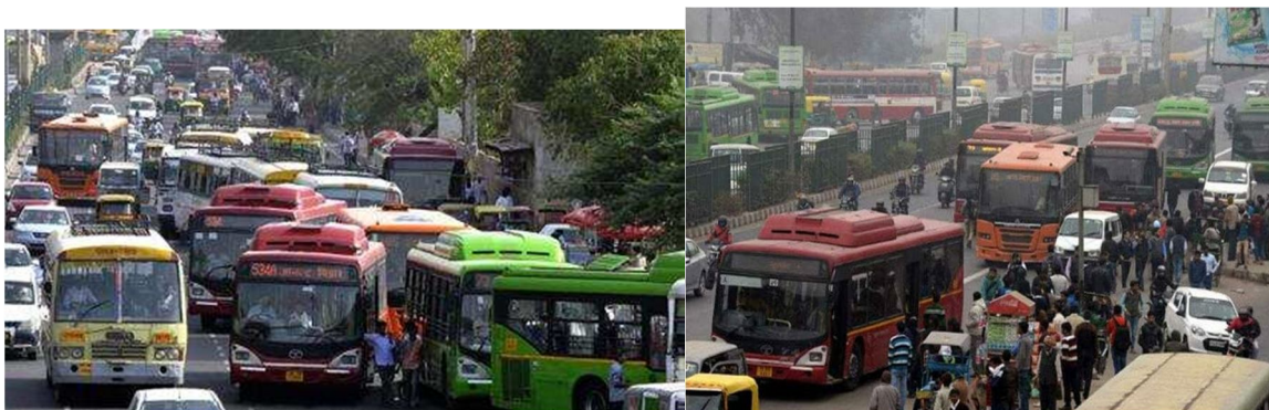
Fig. - traffic congestion at Anand Vihar-Delhi