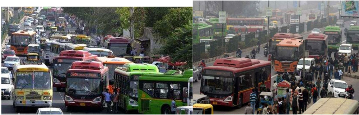
Fig. - traffic congestion at Anand Vihar-Delhi