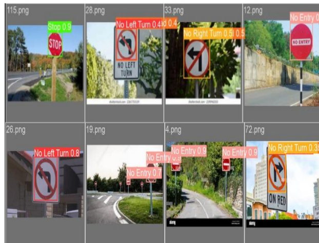
Fig. 5. Validation images containing prediction labels and mAP

The output of test validation data can be seen in Fig. 4 with their respective bounding boxes and confidence scores.