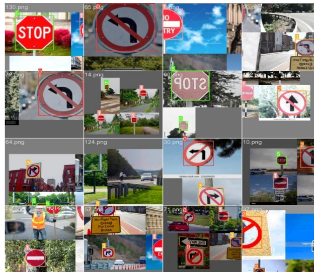
Fig. 2. Annotated Images for different traffic signs

After collecting all the desired images of traffic signs and performing data augmentation, which resulted in around 2500 images, it was necessary to manually label every relevant traffic sign in each of them. Fig. 2. shows an example of the annotated images containing different traffic signs of interest is shown.