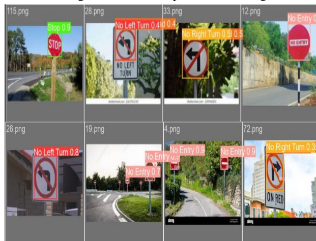
Fig. 5. Validation images containing prediction labels and mAP

The output of test validation data can be seen in Fig. 4 with their respective bounding boxes and confidence scores.