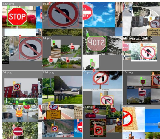
Fig. 2. Annotated Images for different traffic signs

After collecting all the desired images of traffic signs and performing data augmentation, which resulted in around 2500 images, it was necessary to manually label every relevant traffic sign in each of them. Fig. 2. shows an example of the annotated images containing different traffic signs of interest is shown.