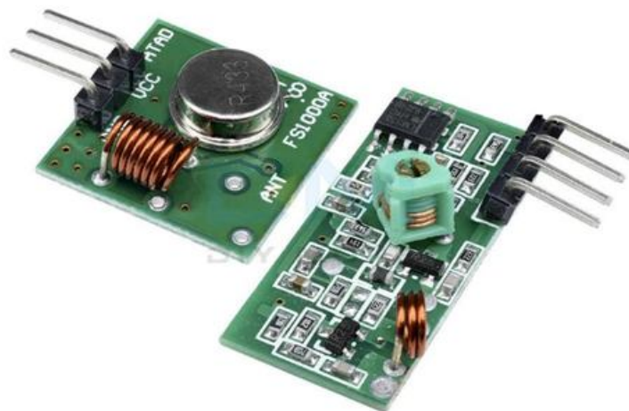
Fig.1 RF Module