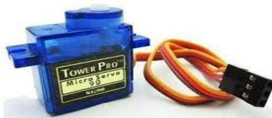
Fig.2 Servo Motor

A servo motor is used to control the movement of the traffic signal arm or barrier at the railway crossing. The servo motor is typically connected to the microcontroller or central control unit of the system and be activated based on the signals received from the train detection sensors. RF module is placed in the trains detect the presence of an approaching train. Once a train is detected, a signal is sent to the microcontroller or central control unit. The microcontroller processes the train detection signal and determines the appropriate action to take at the railway crossing. This includes activating the servo motor to control the movement of the traffic signal arm or barrier. The servo motor movement is designed to provide a clear indication to vehicles and pedestrians about whether they should stop or proceed. For example, when the traffic signal arm is lowered, it signals a red light and a stop to approaching vehicles and pedestrians. The servo motor is connected to the power supply of the TCP system to receive the necessary electrical power for its operation. The use of Arduino in this project provides many benefits, such as flexibility, low cost, and easy to program. Arduino can be easily customized to fit specific project needs and can be programmed to perform various functions. Moreover, it is relatively easy to learn, making it an excellent choice for beginners and hobbyists.