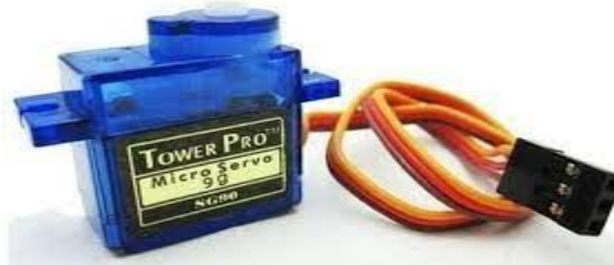
Fig.2 Servo Motor

A servo motor is used to control the movement of the traffic signal arm or barrier at the railway crossing. The servo motor is typically connected to the microcontroller or central control unit of the system and be activated based on the signals received from the train detection sensors. RF module is placed in the trains detect the presence of an approaching train. Once a train is detected, a signal is sent to the microcontroller or central control unit. The microcontroller processes the train detection signal and determines the appropriate action to take at the railway crossing. This includes activating the servo motor to control the movement of the traffic signal arm or barrier. The servo motor movement is designed to provide a clear indication to vehicles and pedestrians about whether they should stop or proceed. For example, when the traffic signal arm is lowered, it signals a red light and a stop to approaching vehicles and pedestrians. The servo motor is connected to the power supply of the TCP system to receive the necessary electrical power for its operation. The use of Arduino in this project provides many benefits, such as flexibility, low cost, and easy to program. Arduino can be easily customized to fit specific project needs and can be programmed to perform various functions. Moreover, it is relatively easy to learn, making it an excellent choice for beginners and hobbyists.