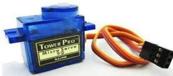
Fig.2 Servo Motor

A servo motor is used to control the movement of the traffic signal arm or barrier at the railway crossing. The servo motor is typically connected to the microcontroller or central control unit of the system and be activated based on the signals received from the train detection sensors. RF module is placed in the trains detect the presence of an approaching train. Once a train is detected, a signal is sent to the microcontroller or central control unit. The microcontroller processes the train detection signal and determines the appropriate action to take at the railway crossing. This includes activating the servo motor to control the movement of the traffic signal arm or barrier. The servo motor movement is designed to provide a clear indication to vehicles and pedestrians about whether they should stop or proceed. For example, when the traffic signal arm is lowered, it signals a red light and a stop to approaching vehicles and pedestrians. The servo motor is connected to the power supply of the TCP system to receive the necessary electrical power for its operation. The use of Arduino in this project provides many benefits, such as flexibility, low cost, and easy to program. Arduino can be easily customized to fit specific project needs and can be programmed to perform various functions. Moreover, it is relatively easy to learn, making it an excellent choice for beginners and hobbyists.