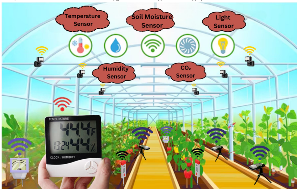
Fig. 1 Layout of key sensors in a smart greenhouse

Automated systems regulate indoor greenhouse conditions, including heating and cooling systems, ventilation systems, and shade devices. Precision irrigation and fertilization systems provide water and nutrients directly to the plant root zone with little waste, using drip irrigation, hydroponics, and aeroponics methods. Energy-efficient technology such as LED grow lights, solar panels, heat recovery systems, and thermal insulation reduce energy loss in heating and cooling operations.