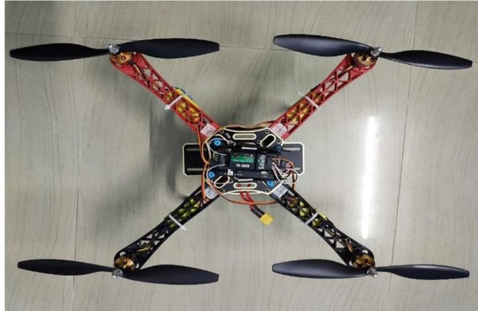
Figure 3. Top View of Quadcopter