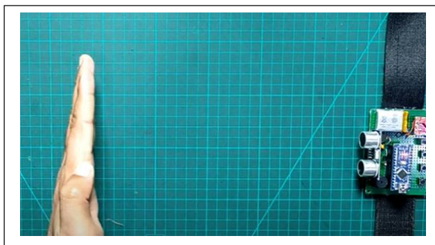
Fig.5.2. Object detection by smart gloves