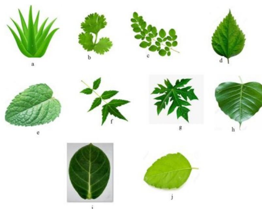
Fig -1: Medicinal plants a-Alovera, b-Coriander, c- Drumstick, d-Hibiscus, e-Mint, f-Neem, g-Papaya, h-Peepal, i- Rui, j-Tulasi