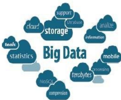
Fig 1 shows a typical bug data representation./ The areasfor example that comes in big data are shown.

Technologies not only supports the collections of large amounts such data effectively. Transactions that are made all over the world in a Bank, Walmart customer transactions, and Facebook users generating social interaction data Are few examples for big data usage. I.