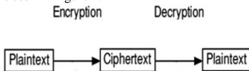
Figure 1: Encryption process

In addition to protecting data against unauthorised access and alteration, it may also be used for authenticating users, which is a useful feature in its own right. The plaintext is first encrypted at the sender's end using keys, and then it is decoded at the receiver's end using those same keys. This approach is seen in Figure 1.