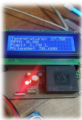
Fig V. Result Analysis

With the help of Vehicle tracking and fuel monitoring system this project we detecting temperature, RPM, Fuel, and Mileage.