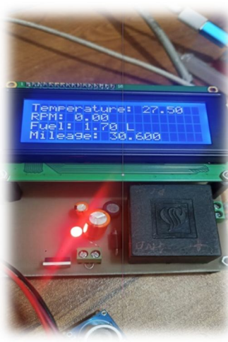
Fig V. Result Analysis

With the help of Vehicle tracking and fuel monitoring system this project we detecting temperature, RPM, Fuel, and Mileage.