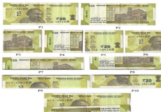
Fig 1: Positions of the dataset image taken