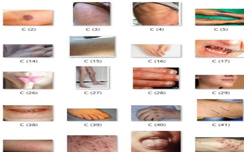
Fig 1.1 Sample Data Set

When the model is trained, is assessed by means of an independent test dataset to determine its precision and effectiveness. Metrics for evaluation like accuracy are employed to assess the model's capacity for accurately categorise dietary deficits. By feeding images of the affected individuals into the trained neural network, the implemented model can be used to detect nutrient deficiencies in people in real time. Those who are at risk of nutrient deficiencies can then benefit from early detection and intervention thanks to the model's predictions.