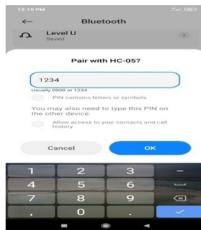
Fig. 4. Pairing with Andriod APP