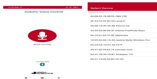
Fig. Connecting to the App