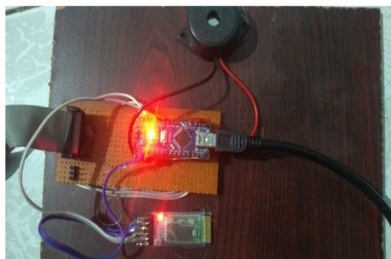
Fig. 3. Hardware results