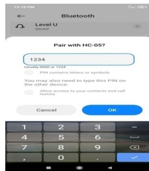
Fig. 4. Pairing with Andriod APP