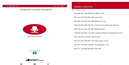
Fig. Connecting to the App