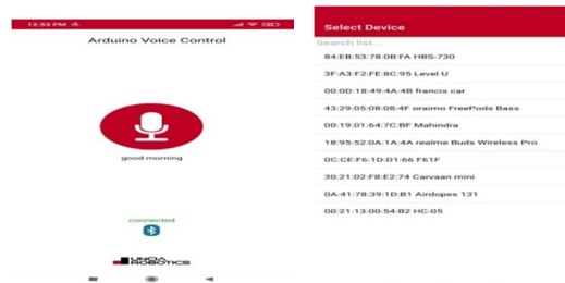
Fig. Connecting to the App