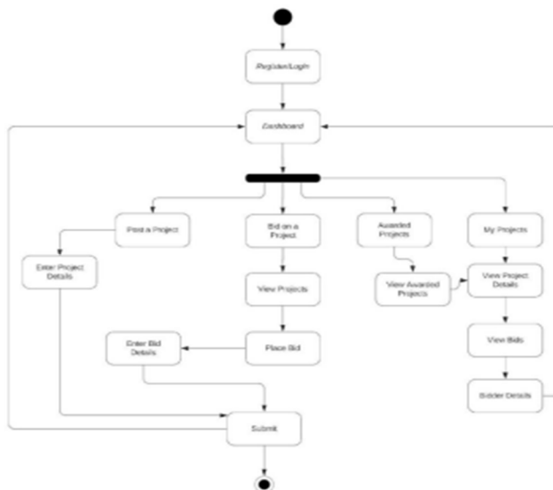
Fig. 1 A Dataflow diagram showing the flow of Vyaapaar outsourcing platform