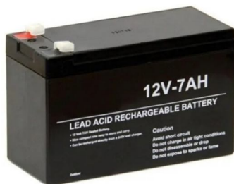
Fig 3.2.4 12V DC lead-acid battery

A 12V DC lead-acid battery serves as a robust and reliable power source in a multitude of applications, ranging from automotive and marine use to backup power systems. Known for its longevity and ability to deliver consistent voltage output, this type of battery is widely favored for its cost-effectiveness and durability. Whether starting vehicles, powering small appliances, or providing backup energy for essential equipment, the 12V DC lead-acid battery remains a staple choice due to its high energy density and resistance to deep discharge cycles. Its versatility and wide availability make it a cornerstone in various industries, ensuring reliable power delivery wherever it's needed.