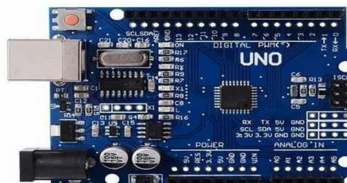
Fig 3.2.1 Arduino Uno

1) Microcontroller: Arduino Uno/Node-MCU