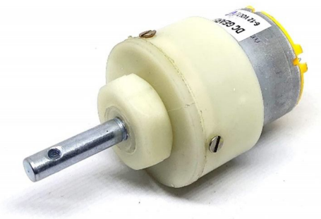
Fig 3.2.3 DC Motor 60 RPM

A DC motor rotating at 60 RPM (Rotations Per Minute) represents a versatile and widely used component in numerous applications. Its moderate speed makes it suitable for tasks requiring precise control or moderate torque output.