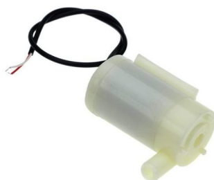
Fig 3.2.6 9-volt water pump

A 9V water pump offers compact, low-voltage fluid transfer for small-scale projects like hydroponics and aquariums. Despite its modest power, it efficiently moves water with a suitable flow rate. Its lightweight design enables easy integration into confined spaces, making it ideal for both hobbyist endeavors and practical applications.