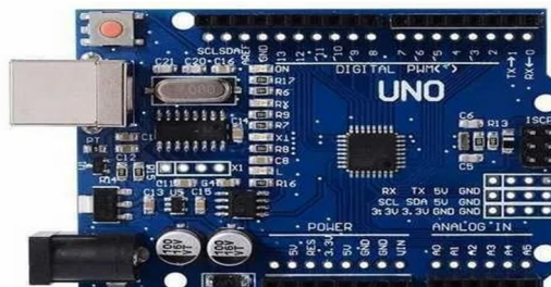
Fig 3.2.1 Arduino Uno

1) Microcontroller: Arduino Uno/Node-MCU