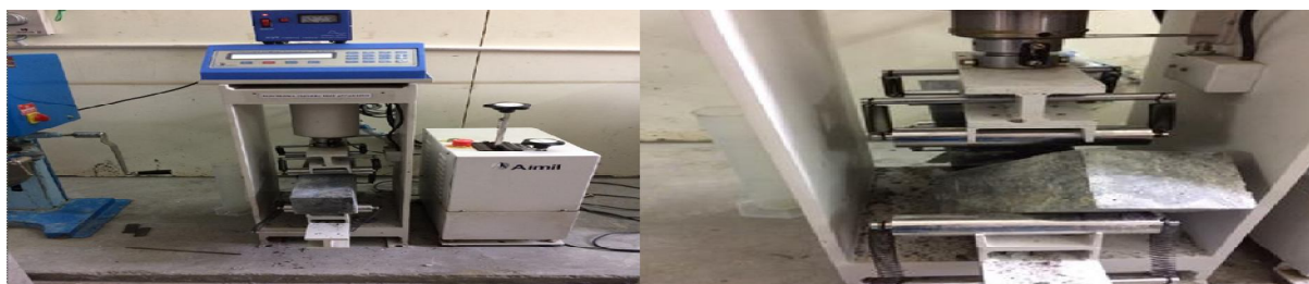
Figure 1. Flexure Strength Test