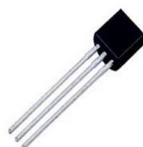
Fig. TEMPERATURE SENSOR

It is used to determine the temperature of the child's immediate environment. To achieve average accuracies, the LM35 Sensor does not require any external trimming. The LM35 is temperature-calibrated directly in degrees Celsius (Centigrade). It can be directly connected to an Arduino. The output of the LM35 sensor can either be fed into a comparator circuit and used as a temperature controller, or it can be used as a temperature indicator by using a simple relay. The LM35 gadget runs between 4 and 30 volts and has a temperature range of 55°C to 150°C. It provides a 0.5°C precision guarantee (at 25°C), is low-cost due to wafer-level trimming, and has a current draw of less than 60 mA.