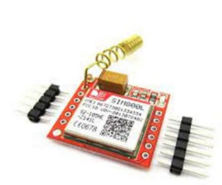
Fig. GSM module

The Global System for Mobile Communications module is intended for SMS monitoring. Small SIM800L GPRS GSM Module Micro SIM Card Core Board Quad-band TTL Serial Port with antenna (two antennas included in this module). A small GSM modem, the SIM800L GSM/GPRS module. This module may be used to perform practically whatever a basic mobile phone can, such as send and receive SMS text messages, make and receive phone calls, connect to the internet via GPRS, TCP/IP, and so on. When the panic button is touched, a text message is sent to the registered phone, coupled with a phone call and a live GPS location. Nano delivers periodic updates to the caretaker through SMS using this module.