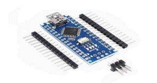
Fig. Arduino Nano

The ATmega328-based Nano Arduino is a tiny, comprehensive, and breadboard-friendly board (Nano R3). It just has a DC power jack and uses a Mini-B USB cable rather than a conventional one. The Nano can be powered by a mini-USB cable, a 6-20V unregulated external power supply (pin 30), or a 5V regulated external power supply (pin 31). (pin 27). The highest voltage source is automatically picked as the power supply. The Nano V3.0 with CH340 Chip is just 43 mm x 18 mm in size, and it features 6 PWM I/O out of a total of 14 digital I/O, 8 analogue inputs, a 16Mhz clock speed, and 32kB of flash memory.