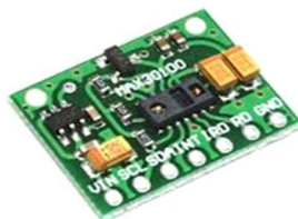
Fig. HEARTBEAT AND SpO2 SENSOR

Maxim's MAX30100 integrated pulse oximetry and a heart-rate sensor are included in the Heart Rate click. It's an optical sensor that measures the absorbance of pulsating blood through a photodetector after emitting two wavelengths of light from two LEDs - a red and an infrared one. This specific LED colour combination is ideal for reading data with the tip of one's finger. A low-noise analogue signal processing device processes the signal before sending it to the target MCU through the mikroBUS I2C interface. Excess motion and temperature variations might also have a negative impact on the measurements. Furthermore, too much pressure can limit capillary blood flow, reducing the data's trustworthiness. There's also a programmable INT pin. This device runs on a 3.3V power supply.