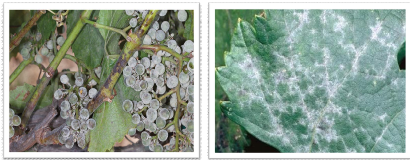
Fig 1: Some variations of powdery Mildew [4][5]

Powdery mildew indications should be visible on foliage, organic product, bloom parts and sticks. Mold for the most part shows up first as whitish or greenish-white fine fixes on the undersides of basal leaves. It might cause mottling or contortion of seriously tainted leaves, as well as leaf twisting and shrinking. Horizontal shoots are truly vulnerable. Contaminated blooms might neglect to set organic product. Berries are generally vulnerable to disease during the initial three to about a month after sprout, yet shoots, petioles and other bunch parts are helpless throughout the season. Contaminated berries might foster a netlike example of reddish brown and may air out and evaporate or never mature. Old contaminations show up as rosy earthy coloured regions on lethargic sticks. Early fine mold diseases can cause decreased berry size and diminished sugar content. Scarring and breaking of berries might be so serious as to make natural product inadmissible for any reason. Winemakers have an exceptionally low capacity to bear fine mold on grapes. Research has shown that contamination levels as low as 3% can pollute the wine and emit flavours [3].