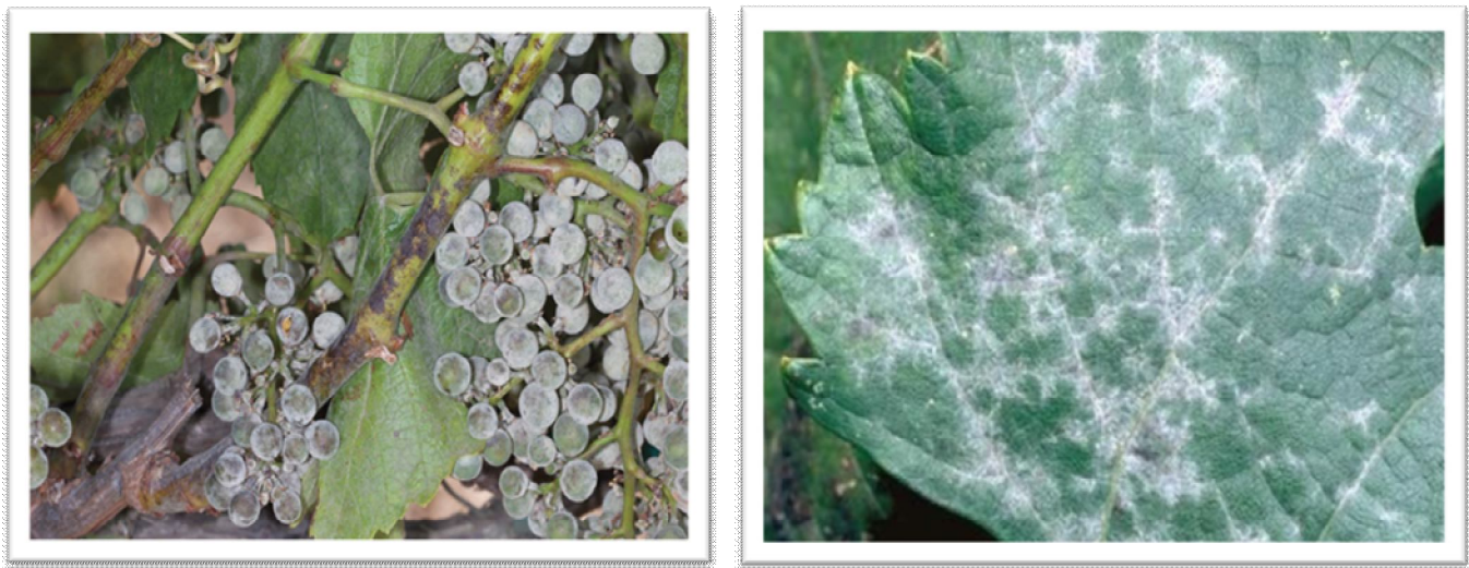
Fig 1: Some variations of powdery Mildew [4][5]

Powdery mildew indications should be visible on foliage, organic product, bloom parts and sticks. Mold for the most part shows up first as whitish or greenish-white fine fixes on the undersides of basal leaves. It might cause mottling or contortion of seriously tainted leaves, as well as leaf twisting and shrinking. Horizontal shoots are truly vulnerable. Contaminated blooms might neglect to set organic product. Berries are generally vulnerable to disease during the initial three to about a month after sprout, yet shoots, petioles and other bunch parts are helpless throughout the season. Contaminated berries might foster a netlike example of reddish brown and may air out and evaporate or never mature. Old contaminations show up as rosy earthy coloured regions on lethargic sticks. Early fine mold diseases can cause decreased berry size and diminished sugar content. Scarring and breaking of berries might be so serious as to make natural product inadmissible for any reason. Winemakers have an exceptionally low capacity to bear fine mold on grapes. Research has shown that contamination levels as low as 3% can pollute the wine and emit flavours [3].