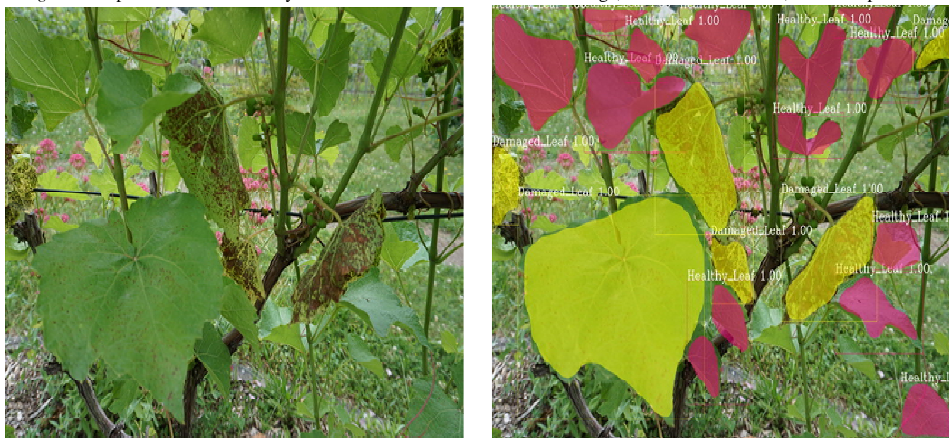
Fig 3: Result of CNN on Test image.

Each image consists of a set of pixel values. Image segmentation is the task of classifying images at the pixel level. The machine can divide the image into different segments according to the class assigned to each pixel value in the image, thereby analysing the image more effectively.