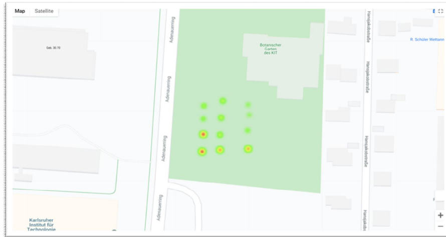
Fig 4: Heatmap AI algorithm