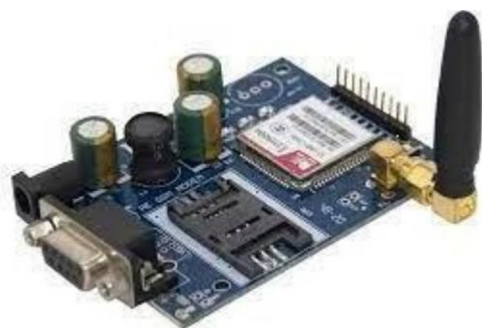
Fig 9. GSM Module

It can be used for tasks such as sending SMS (Short Message Service) messages, making voice calls, and establishing data connections.