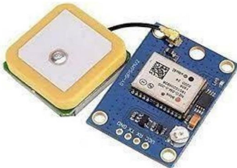
Fig 8. GPS Module NEO-6MV2

In summary, the NEO-6MV2 GPS module is a reliable and cost-effective solution for applications requiring accurate navigation in a compact and power-efficient form factor. Its u-blox 6 positioning engine, coupled with its flexible connectivity options, makes it a popular choice in the world of GPS receivers.