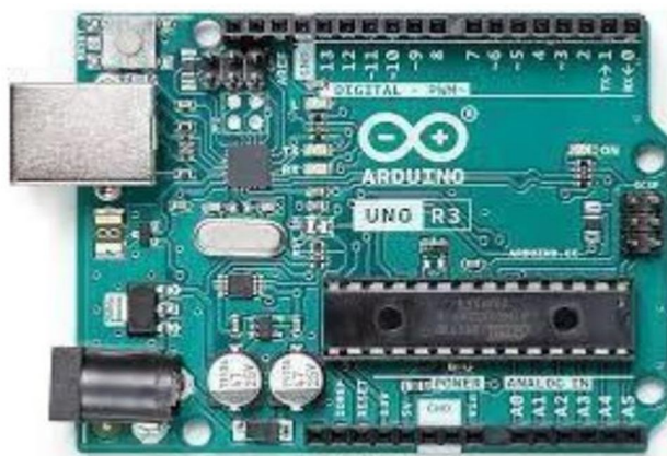
Fig 5: Arduino