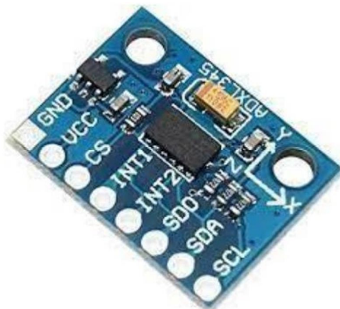
Fig 7. Accelerometer ADXL345