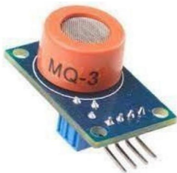
Fig 6: Arduino

In summary, the MQ-3 Alcohol Sensor is a versatile component designed for the detection of alcohol concentrations in the air. Its analog resistive output makes it compatible with microcontrollers and other electronic devices, allowing for the integration of alcohol detection capabilities into diverse systems and applications.