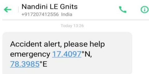
Fig 4: Accident Alert

The wireless black box consists of various components working together to record and store data related to the vehicle's functioning. GPS Module: The GPS module receives signals from satellites and provides information on the location and speed of the vehicle. Accelerometer: The accelerometer measures the vehicle's acceleration, braking, and other factors related to motion. Microcontroller: The microcontroller processes the data received from the GPS module and accelerometer and controls the operation of the wireless module and data storage Wireless Module. The wireless module is responsible for transmitting the data collected from the GPS module and accelerometer to a remote location, such as a cloud-based platform or a web-based interface. Data Storage: The data storage component stores the data collected from the GPS module and accelerometer. This data can be accessed remotely for analysis or used for insurance claims. Power Management: The power management component manages the power supply to the various components and ensures that the device operates efficiently.