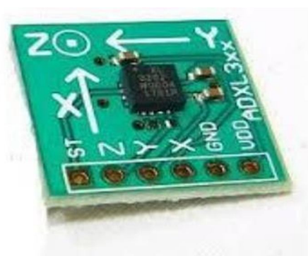
Fig 10. MEMS sensor

MEMS accelerometers use nanotechnology in order to enhance the natural abilities common between all accelerometers; hence, these devices are extremely fine-tuned and accurate. MEMS stands for Micro Electro Mechanical Systems, and when discussing the technicalities of accelerometers, it refers specifically to a mass-displacer that can translate external forces such as gravity into kinetic motion energy. This part of the accelerometer usually contains some type of spring force in order to balance the external pressure and displace its mass, thus leading to the motion that produces acceleration.