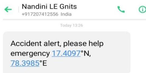
Fig 4: Accident Alert

The wireless black box consists of various components working together to record and store data related to the vehicle's functioning. GPS Module: The GPS module receives signals from satellites and provides information on the location and speed of the vehicle. Accelerometer: The accelerometer measures the vehicle's acceleration, braking, and other factors related to motion. Microcontroller: The microcontroller processes the data received from the GPS module and accelerometer and controls the operation of the wireless module and data storage Wireless Module. The wireless module is responsible for transmitting the data collected from the GPS module and accelerometer to a remote location, such as a cloud-based platform or a web-based interface. Data Storage: The data storage component stores the data collected from the GPS module and accelerometer. This data can be accessed remotely for analysis or used for insurance claims. Power Management: The power management component manages the power supply to the various components and ensures that the device operates efficiently.