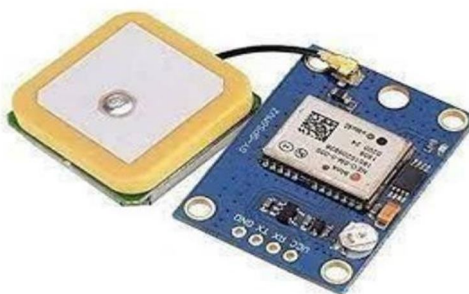
Accelerometer and GPS Module