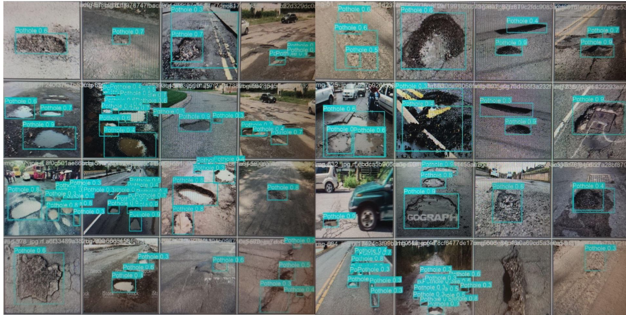
Fig. 4 results from the model