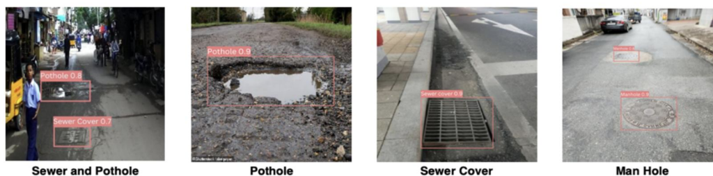
Fig. 3 Pothole Dataset Images [24]