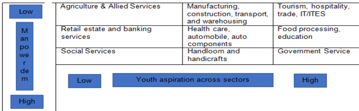
Figure 2: Gap between Youth Aspiration and Market Demand

The phenomenon of surplus of labor semi-skilled and skilled labor calls for fine tuning training offerings. The courses should be designed as per the aspirations of youth and demand in the market. The sectors which have high to medium demand and high youth interest are depicted in the table below.