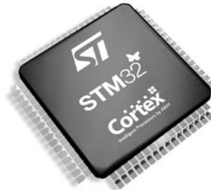
Fig.3: ARM Cortex M3

Instructions set 32-bit hardware integer multiply with 32 or 64 bit result, signed or unsigned, add or subtract after the multiply.