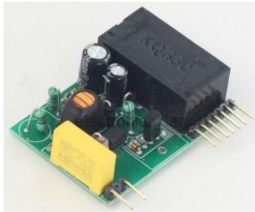
Fig.5: KQ330F PLC MODULE