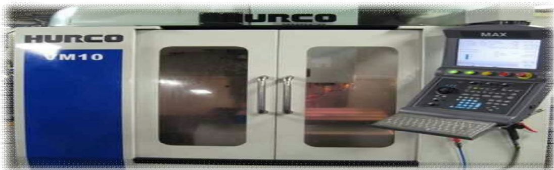
Fig 1 Schematic diagram of CNC vertical milling machine ( Hurco VM10)

The machining test was performed by PVD coated inserts, milling of Hastelloy C-276 was carried on CNC milling machine (Hurco VM10) as shown in Fig 1.