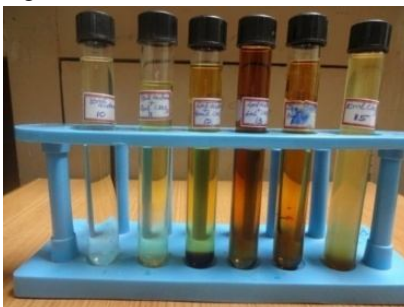
Fig1: Fractions obtained from column

Based on the separation procedure, a total of 15 fractions were eluted. Among the eluted fractions, 12 th , 13 th , 14 th fractions yielded brown coloured sediments that appeared to be crystalline in nature. Hence fractions 12, 13 and 14 (Fig1) were chosen for further analysis.