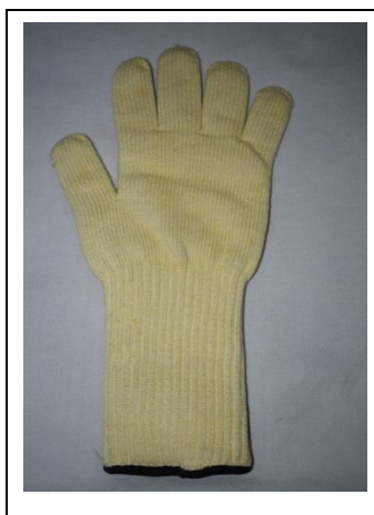
Figure 1: Photographs of High performance knitted e-glass reinforced para-aramid gloves Detergent Used: Commercially available washing detergent i.e. Tide® was used for washing.