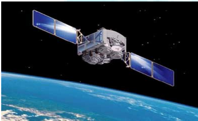
Fig: 1 An Artificial Satellite

Satellite communication service industry has grown more rapidly than was forecasted in 1992. This growth has been a global phenomenon as the economies of world have increased and improved a great extent requiring increased communication services for both business and consumer markets. With this increased demand and recent large, rapid expansion of business, consumer terrestrial mobile and internet communication services has opened new opportunities for satellite communication. Mobile and Internet transport access businesses have stimulated the demand for new multi-state satellite constellation to serve this market on both the national and international scale. Growth in above areas coupled with the global increase in TV viewer ship and high data rate transport have been responsible for the recent and future anticipated growth. There is also new demand for integrated satellite, terrestrial communications that will enable the transport of information seamlessly across these transport