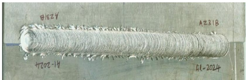
Figure 2: Surface morphology of the FSW coupon of Al alloy to Mg alloy

After welding, metallographic samples and tensile samples were extracted alternatively from weld coupon (Fig. 2). In metallographic samples, Al alloy side was etched by using Kellers Reagent (1 ml HF + 1.5 ml HCl + 2.5 ml HNO 3 + 95 ml distilled water) for 30–50 s and Mg alloy side was etched by solution (14 ml out of '2 g picric acid + 20 ml ethanol' + 2 ml acetic acid + 2 ml water) for 5 s [13].