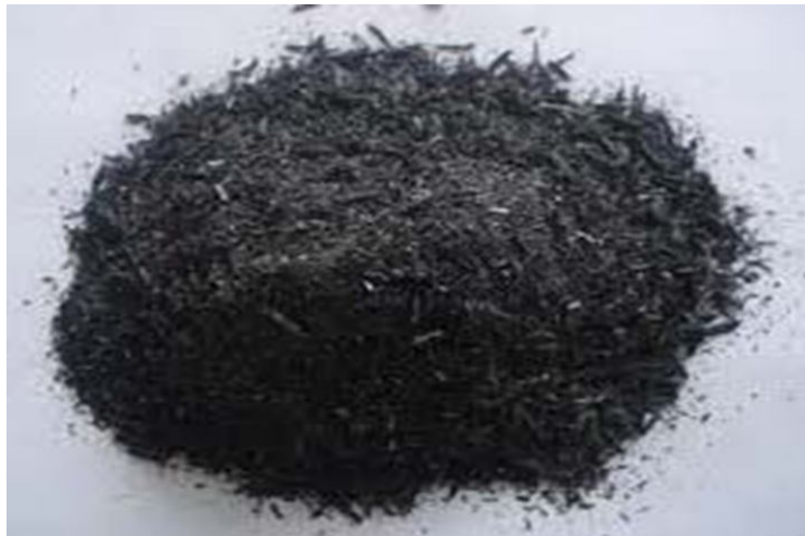
Fig.2 Water Hyacinth Final Products

Water hyacinth was collected from a pond located at Nallepilly, Palakkad. The collected samples are washed and cleaned with potable water to remove dirt and impurities. Then the samples were cut uniformly into a small pieces and dried for over a week. The dried sample is kept in an oven for 800° c for 6 hours to convert the organic matter into an inorganic substance. The samples were ground by a milling machine. The grounded sample was passed through a sieve of size 150micron. The sample collected from the 150 micron sieve has been used as the replacement material for cement.