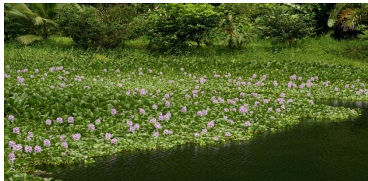
Fig.1 Water Hyacinth Plant in Palakkad Region

Water Hyacinth produces a large biomass by rapidly growing and doubles its population within two weeks. Many problems are caused by the water hyacinth. Some of them are loss of bio diversity, affects water quality, water loss, agricultural implications, damage to infrastructure and it affects health and safety of humans as well as some aquatic species. Hence, the bio – admixture extracted from the water hyacinth can be used as the replacement material for cement and it is cost effective. In this research work, bio waste is utilized as a substitute of cement in concrete.