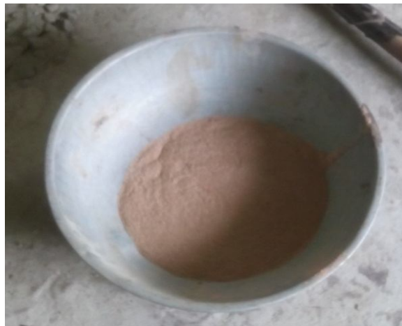
Fig.1 Ceramic tile powder

The ceramic powder is obtained from the industrial by-products or as the solid waste dumped in any major city. As the ceramic in landfill it takes thousands of years to be degradable and cause land pollution. So some of the not recycled ceramic can be converted into ceramic powder and used as cement replacement. The usage of ceramic in the form of powder is better than using it as fine or coarse aggregate. The tile dust is obtained from RAK ceramics. The specific gravity of tile dust is found to be 2.62 and the fineness is found to be 7.5%.