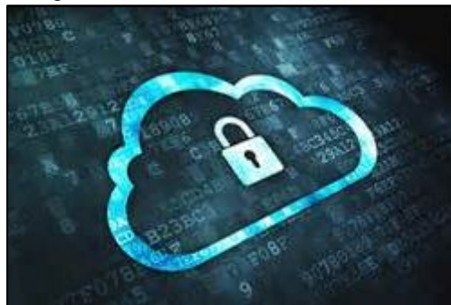
Fig.2 Cloud Security

[3] There are numerous security issues and challenges in cloud computing because it encompasses many technologies such as networks, databases, operating system, virtualization, resource scheduling, transaction management, concurrent control and memory management. This is very important because the cloud service provider must ensure that the users is not facing any serious problem like data loss and data theft which may cause a great loss depending on the sensitivity of the data stored in cloud. A malicious user may pretend to be the legitimate users and infecting the cloud.