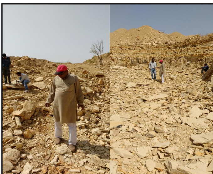
Fig1. Location map showing fossil locality in and around SankhlaBasti, ShriKolyatJi, Bikaner, Rajasthan.

Photographs in the plate 1 showing the field work in and around Fuller’s Earth Mine, SankhlaBasti.