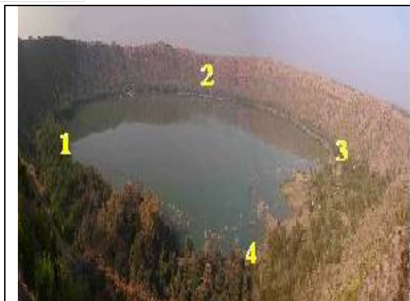
Figure 2: Counter Map of Lonar Crater rim

‘1’ – station- „A“ water from Ramgaya (East), ‘2’ - station „B“ water from Lord Shiva Temple (West), ‘3’ - station „C“ water from Shani Temple (South) ‘4’ - station „D“ water from Devi Temple (North)