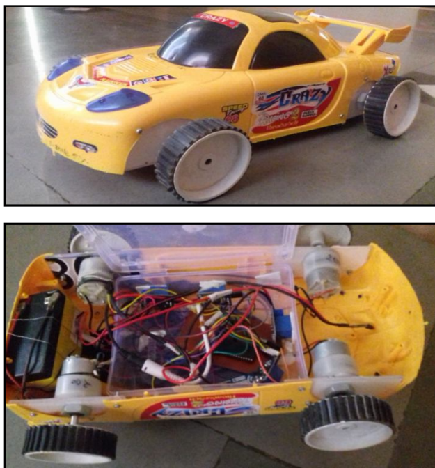
Fig. 4 Project Model