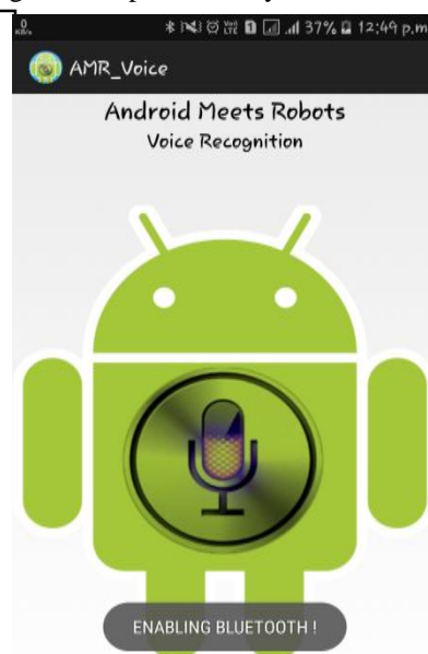
Fig. 3 Movement of robot using voice command