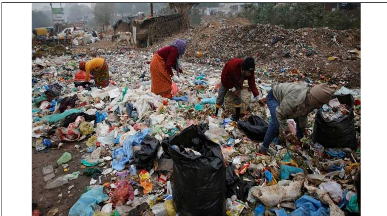
Table: (a) - Cities of huge waste generation in India.