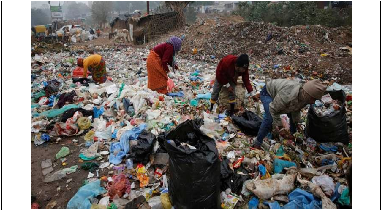
Table: (a) - Cities of huge waste generation in India.