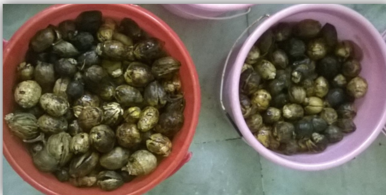
Figure 1: Water retting of areca nut fruit

The rich husk covering the nut is been processed by natural water retting process. In this process of water retting, depending on the temperature, environmental conditions (the presence or absence of oxygen), and sometimes nutrients, different bacteria's take part, namely clostridium sp., Clostridium butiricum, Granulobacterpectinovorum, Clostridium felsineum, Clostridium guerfelli and Bacillus amylobacter. In the case of water retting under anaerobic conditions, pectin materials and hemi-cellulose which bond fibres, decompose and from volatile fatty acids, mainly butyric(80%), responsible for the odour of retting liquor and artificially dried fibres. When sun-drying is performed, the volatile fatty acids undergo decarboxylation and decompose, thus after such drying, water-retted straw, as well as fibre dried in the air, does not have any odour (9). Thus the fibre is exposed to retting process and the fiber is extracted by hand pick methods. The extracted fibre is rinsed with excess of water to make sure the fibre is out of impurities. The rinsed fibre is sun dried for a day to remove excess water content in the fibre.