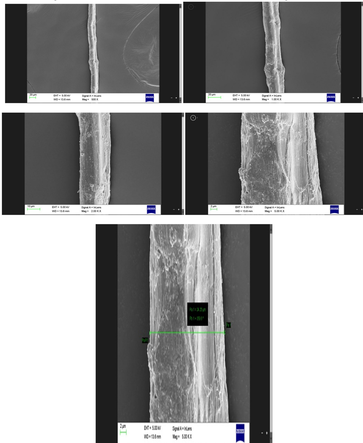
Figure 3: Scanning Electric Microscope

The below are scanning electron microscope images which are under different magnifications where the retted raw areca nut fiber is examined, a bone like longitudinal structure is witnessed with wood like surface and traces of impurities in the surface of the fiber.