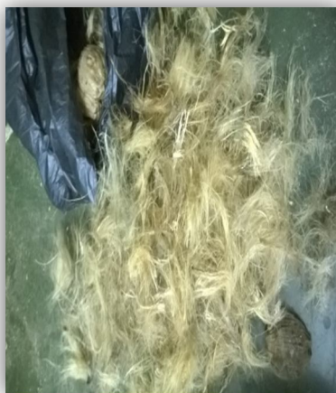
Figure 2: Fiber extracted by hand picking method