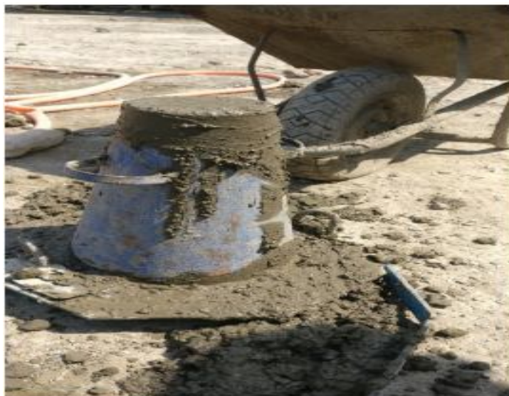
Fig.2 The slump test of concrete.

C.F = \frac{\text{Weight of partially compacted concrete}}{\text{Weight of fully compacted concrete}}