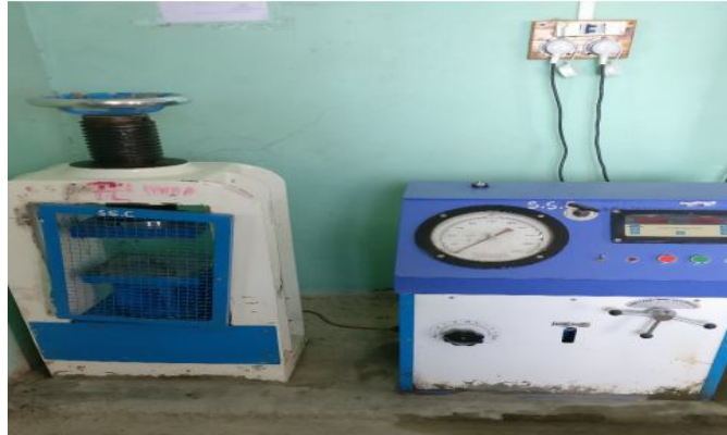
Fig. 1 The compression testing machine

After 28, 7, 3days strength of cubes were checked.