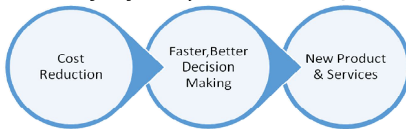
Fig: 1 Benefits of Big Data

data structures. Automatic archival and extraction capabilities And reporting interfaces have been designed To provide more accurate analyses that enable Businesses and in healthcare to make better Decisions. Because the availability of large Amount of data in real time. Collection and Processing of huge volumes provides the Ultimate results [10].