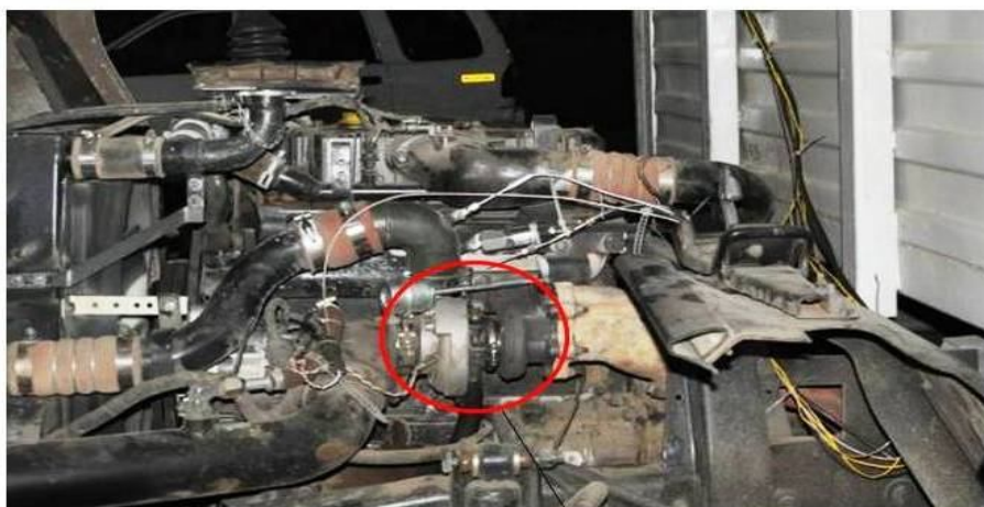
Fig.1 Experimental set up of Data-Logger method

The simulator and data-logger method is adopted to match the turbo Chargers B60J67, B60J68 and A58N75 for TATA 497 TCIC -BS III engine. The simulated matching performance obtained by use of manufacturer data. The desired combination is simulated at various speeds (1000, 1400, 1800 and 2400 rpm) to obtain the predicted operating conditions for this combination. The Pressure ratio and mass flow rates are important parameters to know the turbo matching performance. The simulated observations presented in the Table 3 for B60J67, B60J68 and A58N75 Turbo matching. In data-logger method the turbocharger is connected to the TATA 497 TCIC -BS III Engine of TATA 1109 TRUCK with sensors. The vehicle loaded to rated capacity 7.4 tonnes of net weight. The gross weight of vehicle is 11 tonnes. The experimental setup for Data logger type matching shown in Fig. 1. The operating conditions collected while driving at a specific speed in the selected route For the same set of engine speeds the operating conditions were observed while vehicle driving in the routes like Rough Road, Highway, City Drive, Slope up and Slope down. The observations were recorded in the data-logger automatically through sensors and other sophisticated equipments. Those data logger observations were tabulated road condition wise from Table 4 to Table 8.