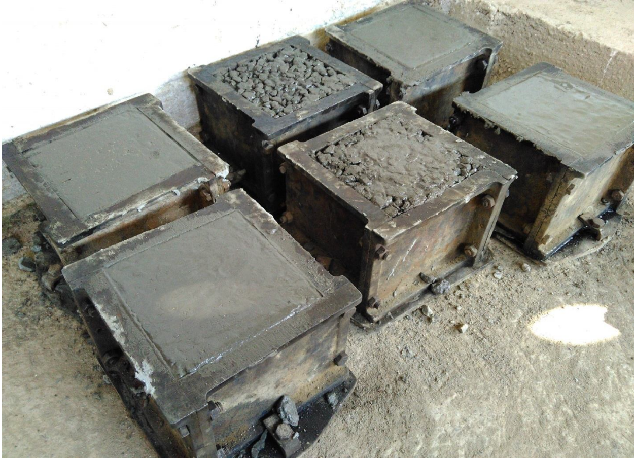
Fig.5: Cast Concrete samples.

The concrete was mixed by the power driven mixer and cubes were filled and vibrated on the vibrating table. Dry mixing with the help of hands was first done in large pans and then it was installed in mixer and water was added. The cubes used as moulds are of dimensions 150mm×150mm×150mm. The cubes were filled and vibrated on the mechanical vibrating table. Then they were allowed to set for 24 hours before the moulds could be removed. The cube moulds were cleaned and oiled before pouring concrete mix in them.