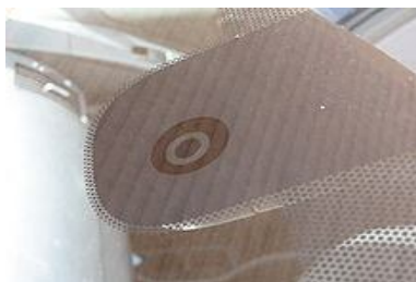
Fig. 5 RainSensor Module

A rain sensor is a switching device activated by when rainfall is come. The two main applications for rain sensor is first a water conservation device connected with automatic irrigation system that alert the system to shut down in the event of rainfall. The second is a device used to protect the inner block of an automobile from rain and to support the automatic mode of windscreen wipers. The other application in satellite communications antennas is to trigger a rain blower device on the aperture of the antenna feed, to remove water droplets from the Mylar cover.