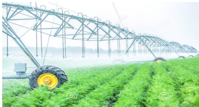
Fig 1. Automatic irrigation system

India is an agricultural country. Lot of new technologies are emerging in the field of agriculture to raise its productivity. But, still there are some ailments in the present agriculture scheme. Few of them are listed below