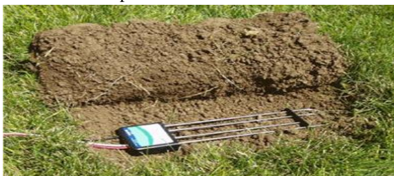
Fig. 3 Soil Moisture Sensor Module

comparator. The circuit shown below has a fixed sensitivity. This can be changed by implementing a pot in place of one of the resistors connected to the non-inverting terminal of the comparator.