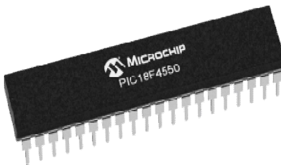
Fig.4 PIC18F4550 microcontroller

PIC18F4550 is a 8-bit microcontroller in PIC18 family. PIC18F family is based on sixteen bit instruction set. This microcontroller consists of 32 KB f memory, 2 KB SRAM, 256 Bytes EEPROM. It is a 40 pin PIC Microcontroller containing of 5 five input & output ports. The other ports have different numbers of pins for I/O data communications. PIC18F4550 work on different internal and external clock sources. It operating frequency range is from 31 KHz to 48 MHz. It has four in-built timers. Is this microcontroller is equipped with enhanced communication protocols like EUSART, SPI, I2C, USB etc. It works irrigation pump in accordance with received decoded commands from GSM module and signals from all sensors. The relay is connected between microcontroller and irrigation pump unit.