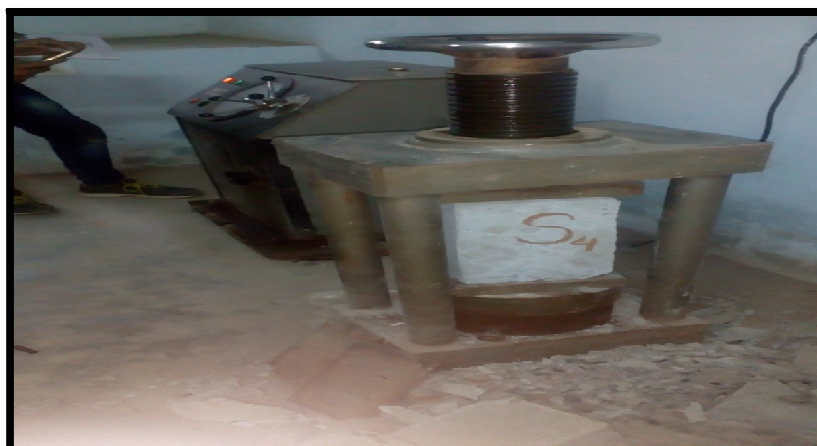
Fig.8-Columns after strengthening with GFRP