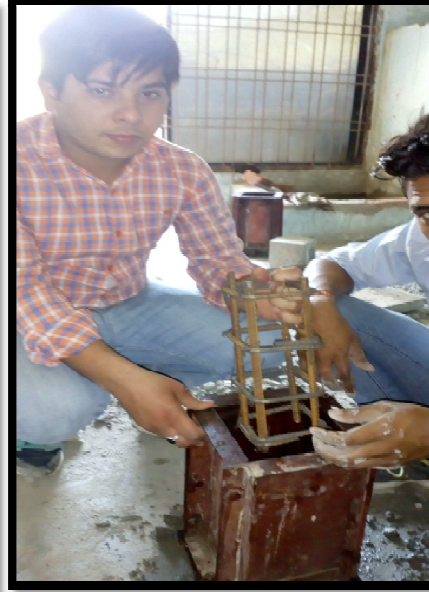
Fig.2- reinforcement with mould