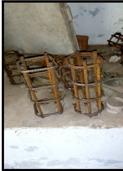
Fig.1 – detail of reinforcement

Strengthening of columns before bonding the composite fabric on to the concrete surface the required region of concrete surface was made rough using a coarse. Sand paper texture and cleaned with an air blower to remove all dirt and debris. One the surface was prepared to the required standard, the epoxy resin was mixed in accordance with manufacturer's instructions mixing was carried out in a plastic container and was continued until the mixture was in uniform color. When this was completed and the fabrics had been cut to size, the epoxy resin was applied to the concrete surface. The composite fabric was then placed on top of epoxy resin coating and the resin was squeezed through the roving of the fabric with the roller. Air bubbles entrapped at the epoxy/concrete or epoxy/fabric interface were to be eliminated. Then the second layer of the epoxy resin was applied and GFRP sheet was then placed on top of epoxy resin coating and the resin was squeezed thorough the roving of the fabric with the roller and the above process was repeated. This operation was carried out at room temperature. Concrete specimens strengthened with glass fiber fabric were tested after 24 hours at room temperature. Strengthening process of specimens is shown in figure 2, 3 and 4 .