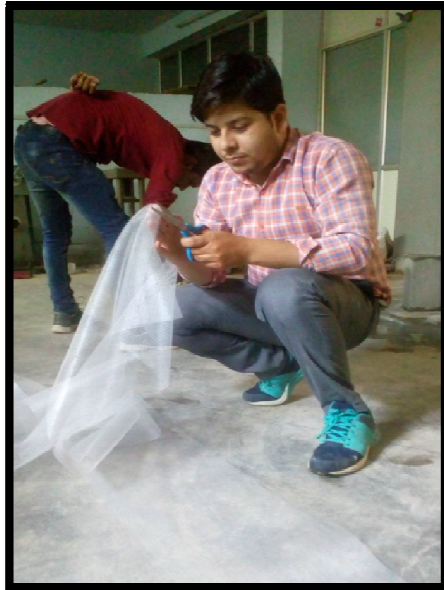
Fig.5 – cuttings of FRP material