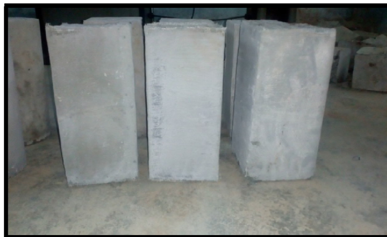
Fig.7-Columns after strengthening with GFRP