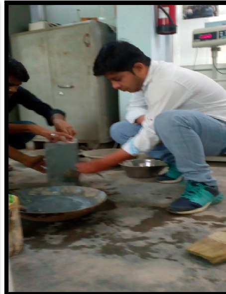
Fig.6 - using epoxy resin