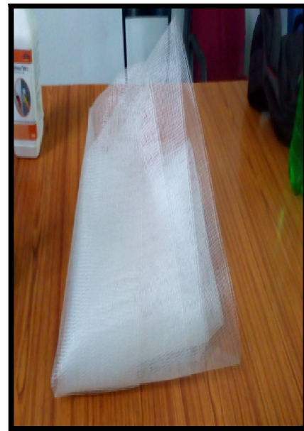
Fig.4 fiber reinforced