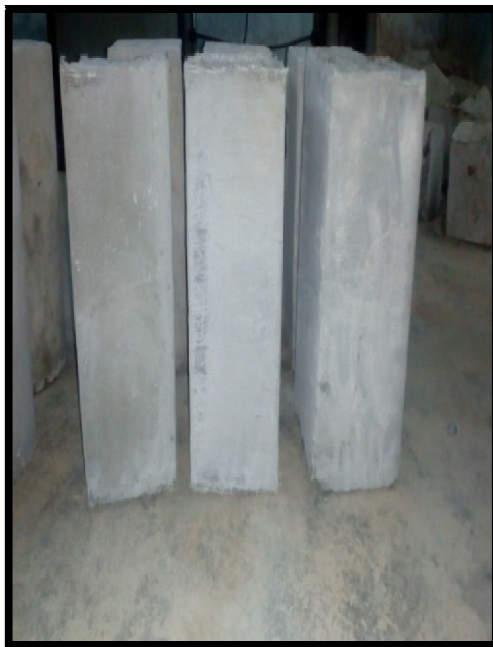
Fig.3 – Columns after 28 days curing